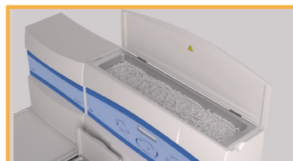
Capacity up to 5 l