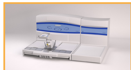
Cryo module can be arranged to the right or to the left