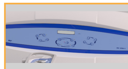
Clear arrangement of the buttons and easy to read two-line display