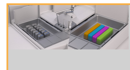
Removable trays for storage of cassettes and molds. Surplus paraffin is drained into waste, removable drawers.